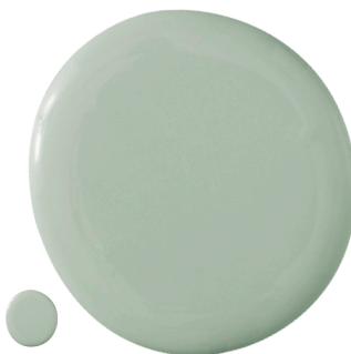
HANCOCK GREEN HC-117 BENJAMIN MOORE

"This celadon is a little more serious than a lot of light greens. It's got a touch of gray, which gives it some depth. That makes it more earthy and sort of quiet, which is ideal for a work space. You get color and warmth, but it's not too much of a commitment. And it goes with everything, so it's a great backdrop."