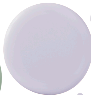
VIOLET DUSK 1409 BENJAMIN MOORE

"Working from home can be a real challenge. Just around the corner are all sorts of distractions, so a home office has to be both inviting and calm—a place where you can focus. I like this soft violet because it's barely there in the bright midday sun but gains richness as the light recedes over the course of the day."