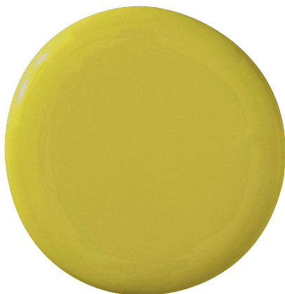
EVE GREEN 2024-20 BENJAMIN MOORE

"This wall was really asking for something. In the midst of a light, white room, the splash of chartreuse is very spicy and yet oddly neutral. It really sets off all the other colors around it, even the simple putty-white cabinets and the old sepia poster. It's a nice jolt of happy energy."