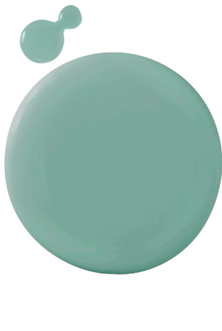
ST. LUCIA TEAL 683 BENJAMIN MOORE

"Sometimes designing for a couple can make you feel like you're a referee at a battle of the sexes. This teal appeals to both men and women, which made it perfect for an office that was going to be shared. It's robust but not too bold, and it would infuse any space with understated warmth."