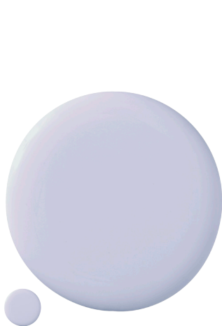
HALF LIGHT 29-2 PRATT & LAMBERT

"The idea came to me after a surprisingly relaxing Virgin Atlantic flight from Los Angeles to London. The lighting in the plane was programmed to sync with the duration of the flight, and it varied through a cycle of warm, tranquil colors—including this lavender. The flight crew told me the lavender was specifically chosen to relax the mind."